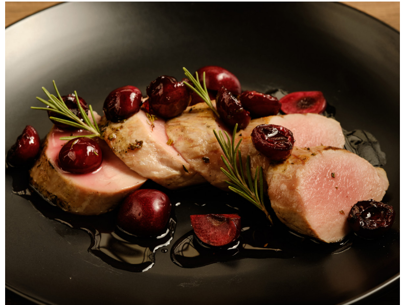
Jack Daniels Pork Tenderloin with Cherry Compote