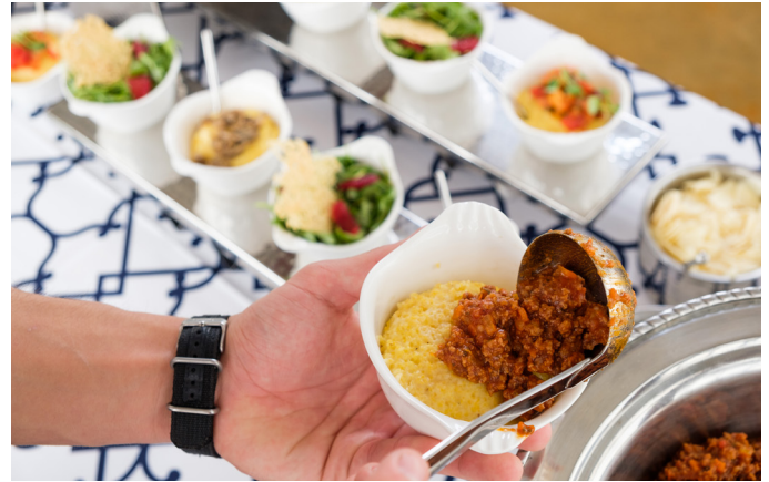
Polenta Bar Station