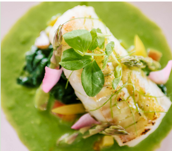
Monkfish Beurre Monte