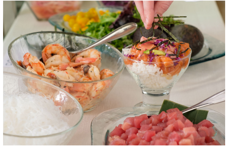
Poke & Tataki Bar