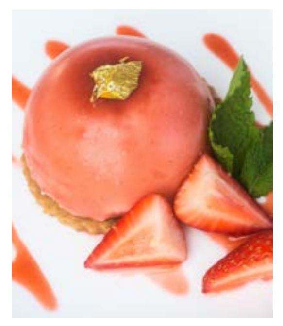
Honey Chevre Mousee Dome with Strawberry Filling